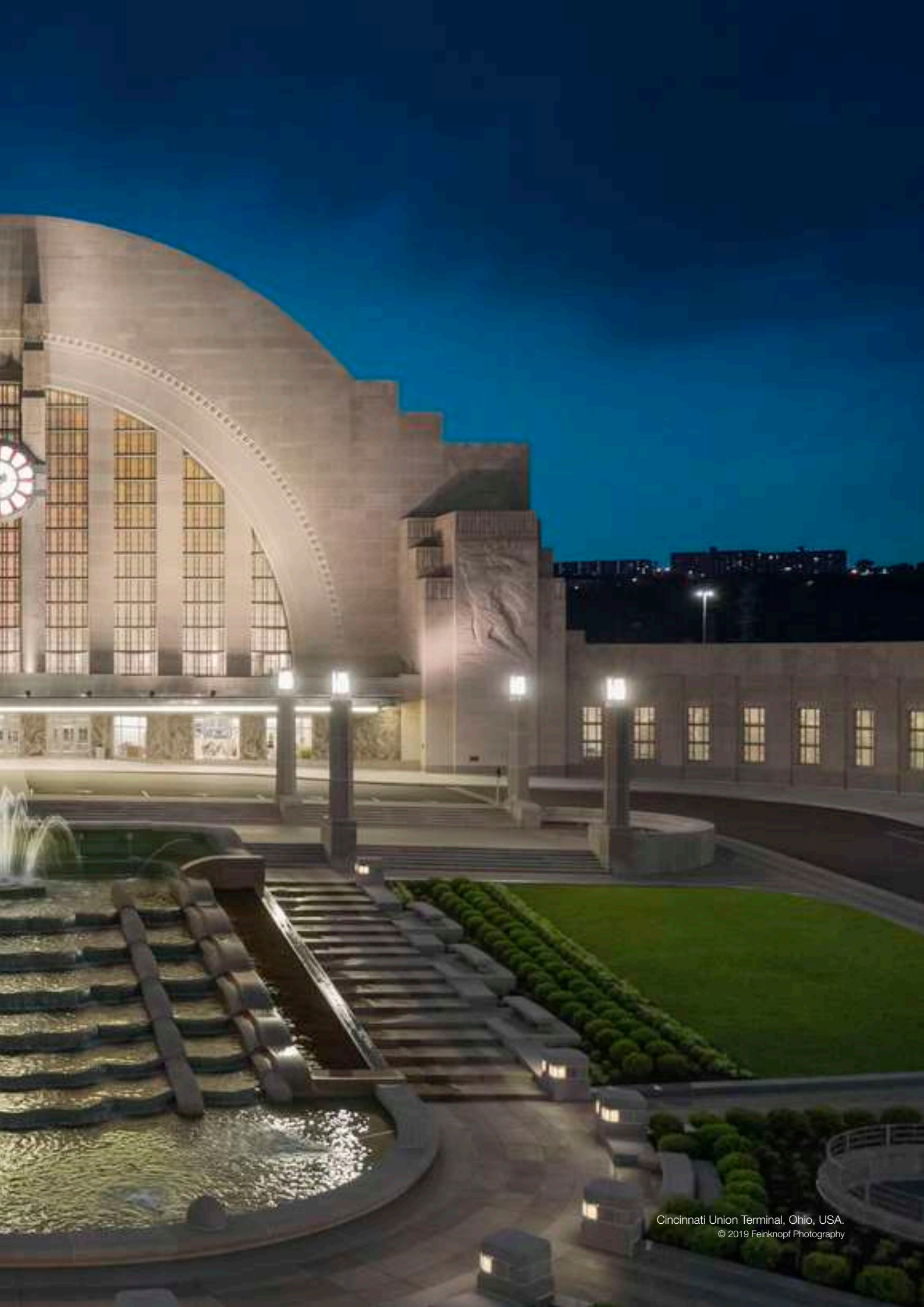
Cincinnati Union Terminal, Ohio, USA.