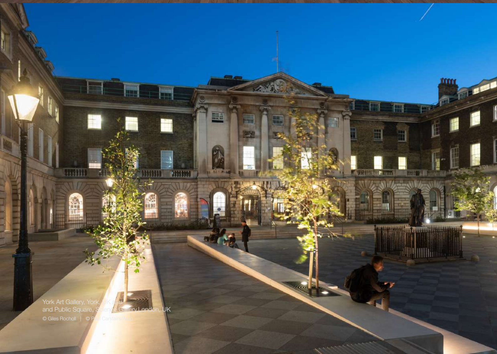
York Art Gallery, York, UK and Public Square, Science Gallery London, UK