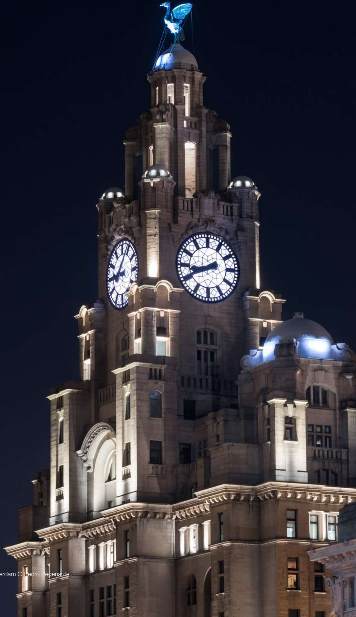
Royal Liver Building, Liverpool Cover: New Rijksmuseum Amsterdam